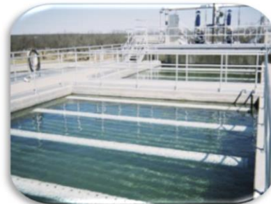
Conventional water treatment plant