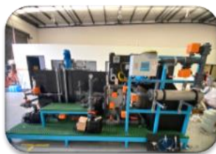
Recycled water plant